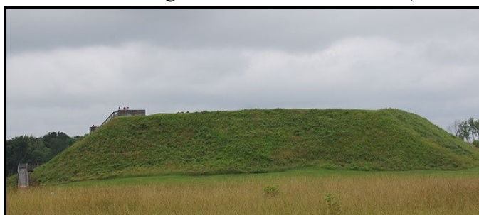
Great Temple Mound at the Ocmulgee National Monument

In lieu of the regularly scheduled monthly meeting for May, members and friends are invited to attend the Annual Society of Georgia Archaeology's (SGA) Archaeology Month meeting at the Georgia Sports Hall of Fame, 301 Cherry Street, Macon. This will include an afternoon visit to the Ocmulgee Mounds, the excellent museum that is there, and Fort Hawkins. Pre-registration is available online ( click here ) or at the door. Attendees to all SGA activities are expected to be registered (including if you just attend afternoon events). The amount is members $10, nonmembers $15, and students $5. You can also sign up and prepay for a box lunch (i.e.; Subway sandwich, chips, cookie, and a drink).