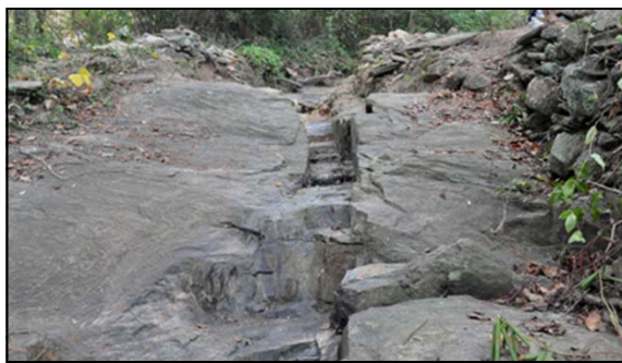
The Channel at Berkmar

While not an historic feature as had been suspected, it is nevertheless a very unusual natural feature indeed!