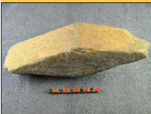
Berkmar Mystery Object

Join GARS and/or FDF to participate and support our efforts in preserving Gwinnett County's historic sites. Applications are on GARS & FDF Web sites or just email us!